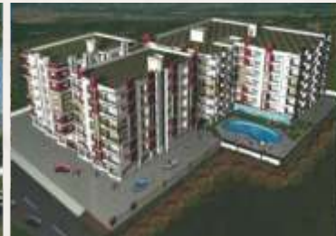
Rudra Ramesh Complex, RK Puram, Khagaul Rd, Patna (Completed)