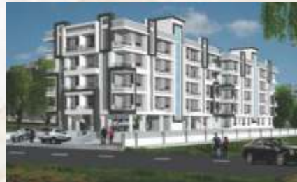
Rudra Dulari Complex Bhagwat Nagar, Patna (Completed)