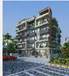
Rudra's Radhe Villa, Khagaul road Ashopur (On Going)