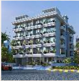
Rudra's Radhe Anand Complex, Khagaul road Ashopur (On Going)