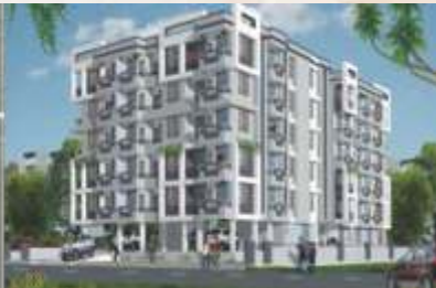
Rudra Sharmanand Complex East Gola Rd, Patna (Completed)